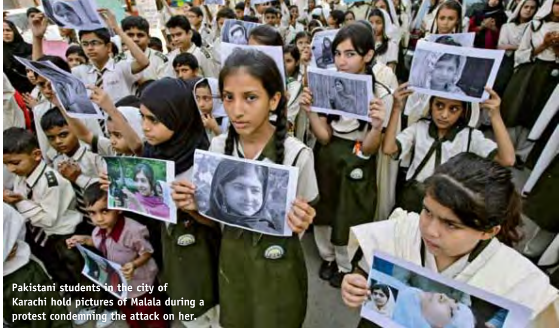
Pakistani students in the city of Karachi hold pictures of Malala during a protest condemning the attack on her.